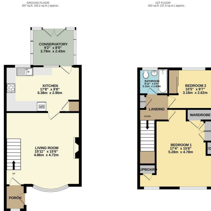
ROSE BAY COTTAGE, EAST HARLSEY, NORTHALLERTON, DL6 2BL

TOTAL FLOOR AREA: 899 sq.ft. (83.5 sq.m.) approx. Whilst every attempt has been made to ensure the accuracy of the floorplan contained herein, measurements of doors, windows, rooms and any other items are approximate and no responsibility is taken for any error, omission or mis-statement. This plan is for illustrative purposes only and should be used as a guide only by any prospective purchaser. The services, systems and appliances shown have not been tested and no guarantee as to their operability or efficiency can be given. Made with Metropix 12/20